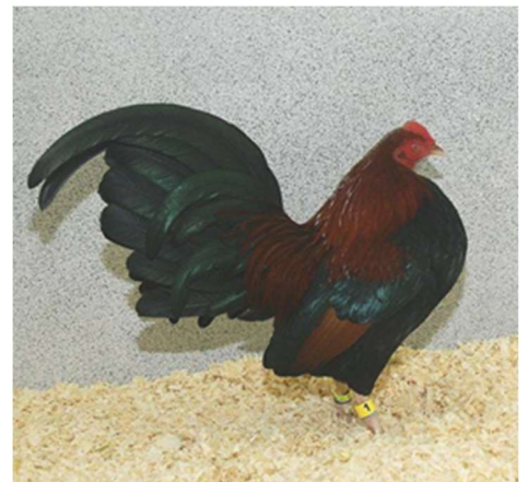
Reserve Show Champion and Champion Bantam – BB Red OEG.