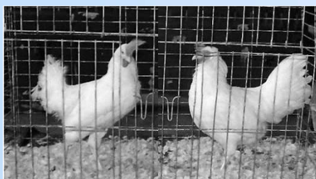
Single Comb White Leghorns. Commercial-hatchery type on left. Exhibition Purebred type on right.

Commercial brown egg layers are generally specialized cross-bred birds that go by any number of names: red sexlink, black sex-link, sil-go-link, red star, comet, Rhode Island Red, etc. Many of these names have been chosen by companies to distinguish their own personal breed of brown egg layers from other companies' birds. Most of the confusion for exhibitors and from the public comes from the Rhode Island Red breed. Remember that purebred exhibition birds have been selectively bred for many years for exhibition and they possess the qualities that are listed in the standards while the commercial strains have been selectively bred for heavy egg production and do not possess the qualities