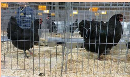
Large fowl Jersey Giants. Hatchery type on left, Exhibition Purebred on right.

Some shows allow exhibitors to show poultry meat pens. These are crossbred birds that have been bred for extremely fast growth on minimal amounts of feed. Historically they were bred from the white Cornish and the white Plymouth Rock breeds but have long since have become a much different type of bird. They are white feathered because of the pigment that can be left on the carcass after slaughter. Dark feathers leave dark spots where each feather was plucked whereas white feathers leave no markings on the carcass. The actual breeding lines of the commercial hatcheries that deal with these birds are closely guarded. These