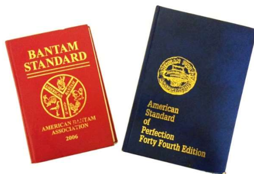
The ABA Bantam Standard and the APA Standard of Perfection

Now you've selected the best birds from that grow out pen, with some help from a seasoned exhibitor or breeder, and you're wondering, "What's next?" Conditioning really starts at hatch, but we'll assume that you've been feeding your birds a good feed and they are all healthy. You've been giving them treats, so they