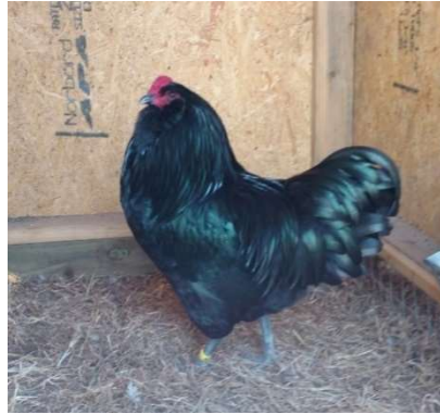
Nice side profile of black Ameraucana cockerel. This bird was Champion AOSB and Reserve Champion Large Fowl at a recent North Carolina

of reach, but not much. Different breeds have different requirements, so remember about studying that Standard of Perfection you've already purchased.