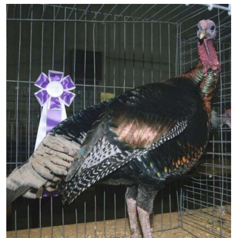
Champion Turkey – Bronze Turkey.