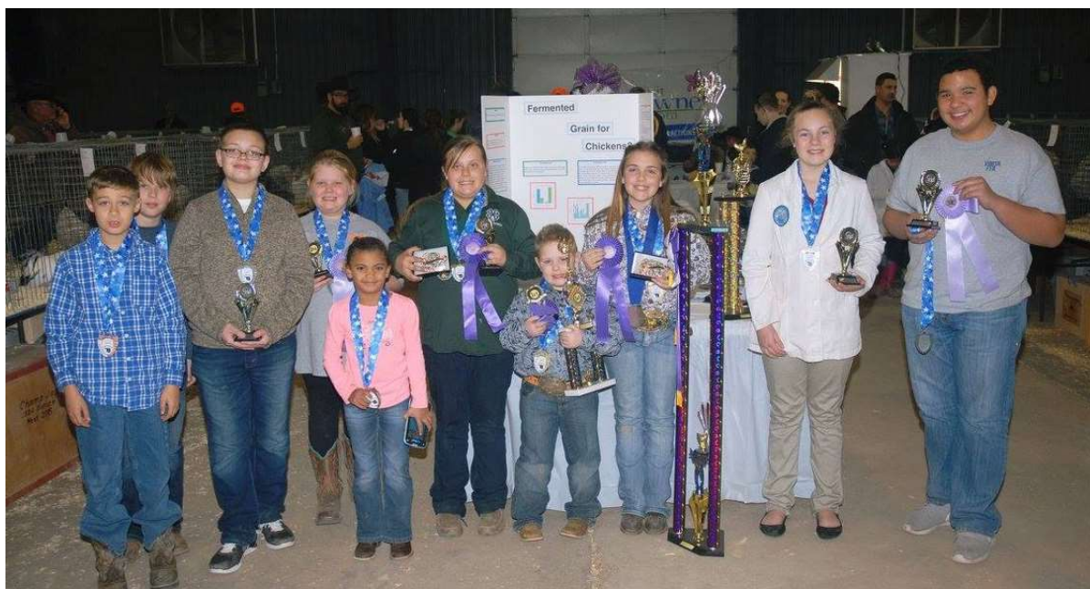
YEPA Showmanship Winners at the Oklahoma State Poultry Federations December 9, 2017 Show – Shawnee, OK