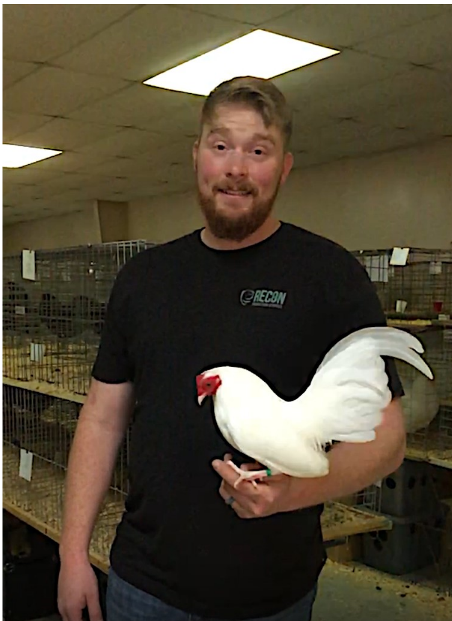
Show Champion: White OEG cockerel - Igo & Dooley.

Feather Leg (146 entries): Bearded White Silkie pullet - To-