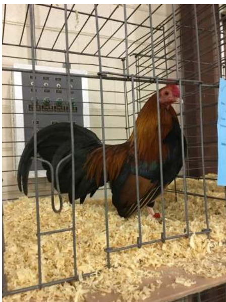
Champion Old English Game: Wheaten cockerel exhibited by Thomas Bantams.