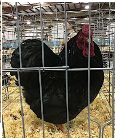
Champion RCCL: Black Wyandotte cockerel exhibited by Copper Ridge Farms.