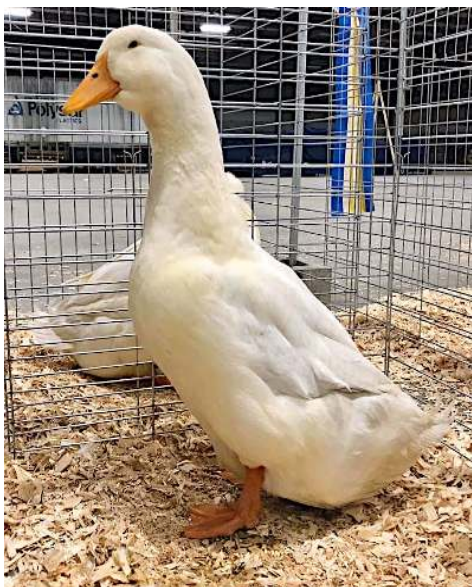
Champion Waterfowl: White Pekin cock exhibited by Alexandra Wisniewski.

Champion Large Fowl: Non-Bearded White Crested Black Polish pullet - Sydnee Fisher. Reserve: Black Cochin hen - Zheta Phimvongsa. 3rd Best: Non-Bearded White Crested Black Polish pullet - Alec Bergin.