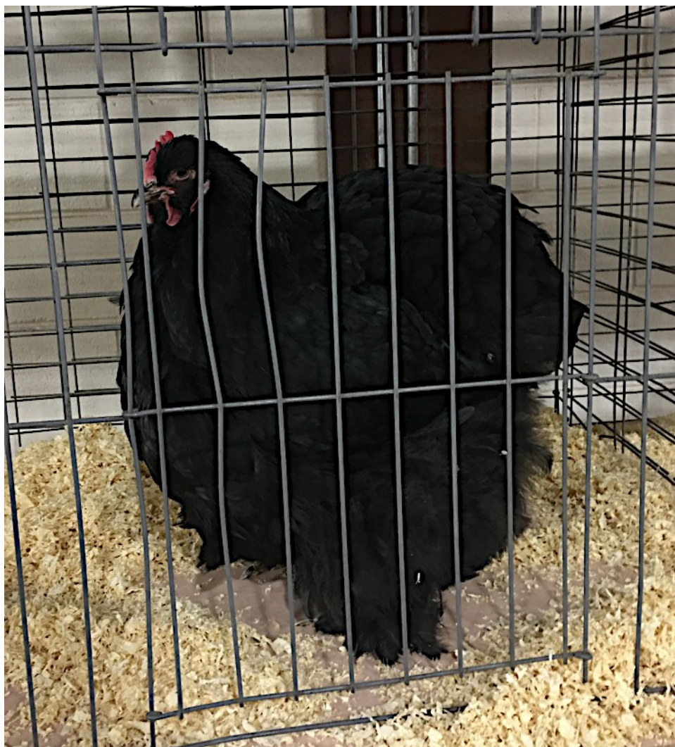
Champion Large Fowl and Champion Asiatic: Black Cochin hen exhibited by M & M Poultry.