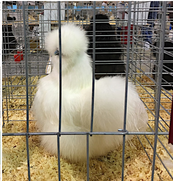
Junior Show Champion & Champion Bantam: Bearded White Silkie pullet exhibited by Olivia Germany.