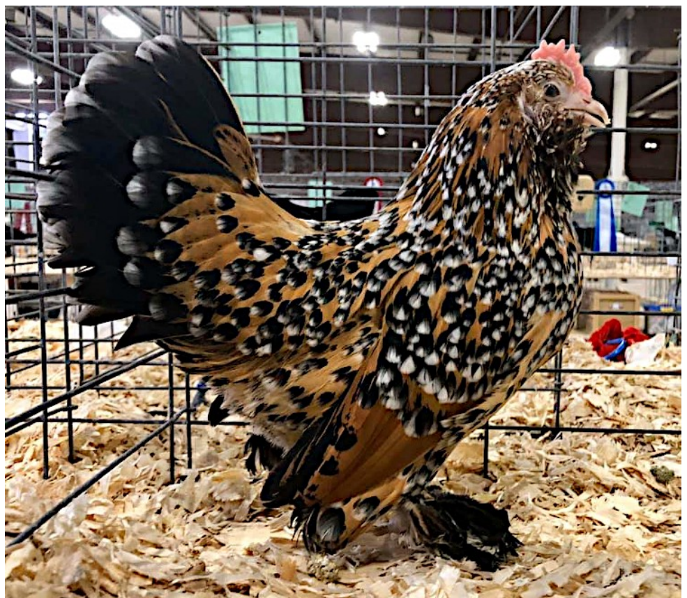
Best of Breed: Belgian Bearded d'Uccle.