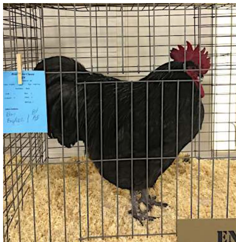
Champion English: Black Australorp cockerel exhibited by Matt Ulrich.

Show Champion: Brown African cock: Jacob Bates. Reserve Show Champion: White Plymouth Rock pullet - Jerry McCarty.