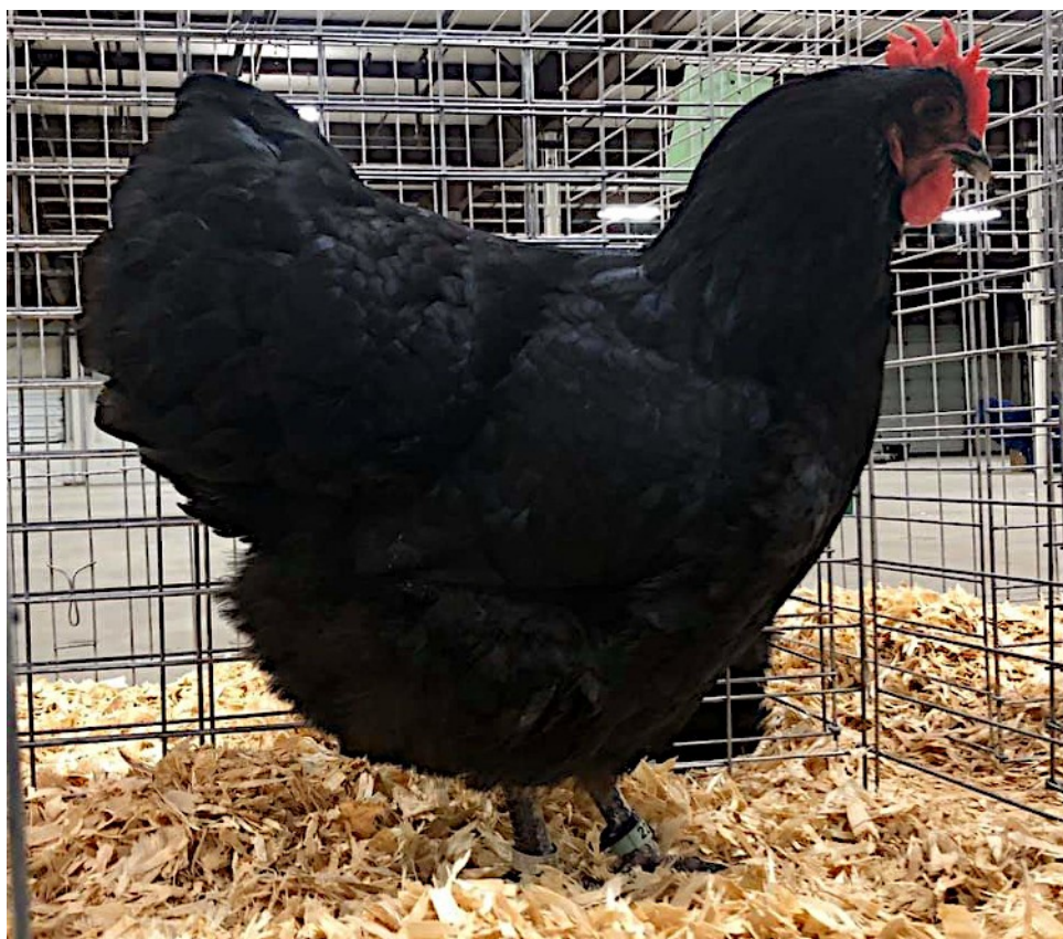
Super Grand Champion of Show: Black Australorp hen exhibited by Dan Castle.