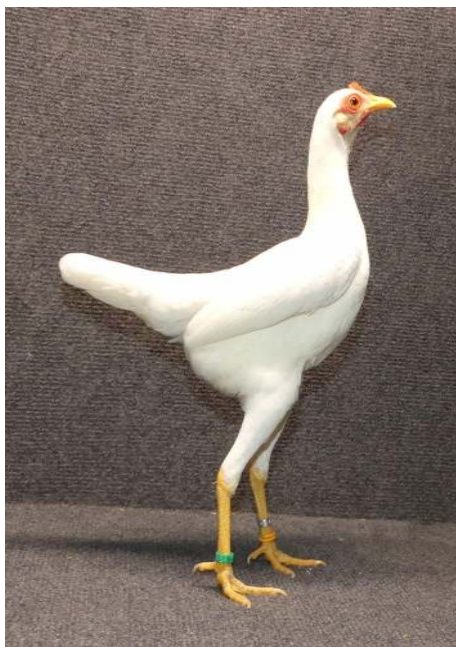
Reserve Champion Modern, White pullet exhibited by Tom Kane.