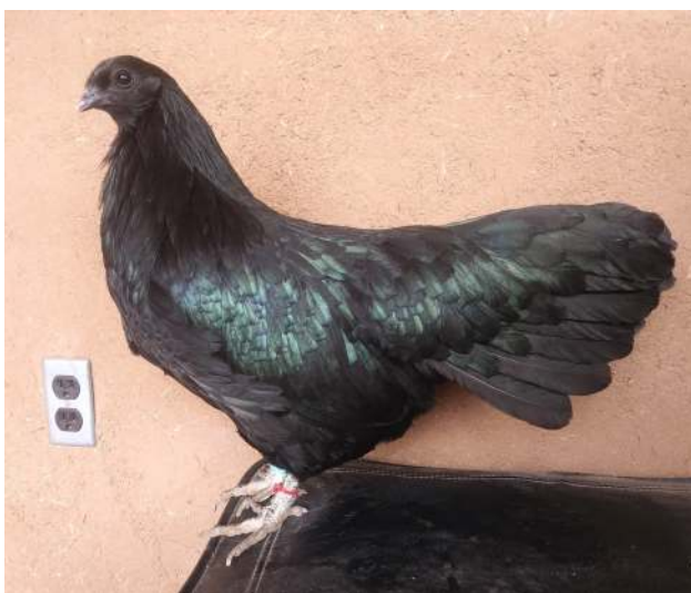
Champion AOSB (4 entries): Black Sumatra hen submitted by Raven Meyers, Silver City, NM. Reserve: Black Ameraucana cockerel submitted by Mindy Waters.