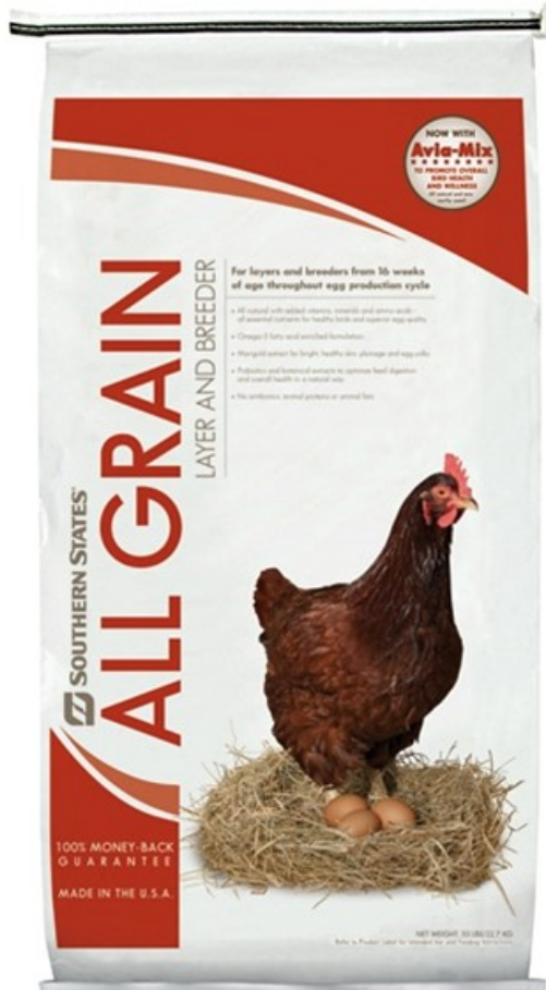
SOUTHERN STATES ALL GRAIN LAYER & BREEDER PELLET

A complete vegetarian feed that is ideal for egg layers and breeders 16 weeks of age and up. The nutrient dense, all-natural formulation results in eggs produced with higher levels of vitamins, minerals, and omega 3 content, and superior egg shell and yolk quality. The added probiotic optimizes feed digestion. Southern States All Grain Layer & Breeder is free of antibiotics, animal proteins and animal