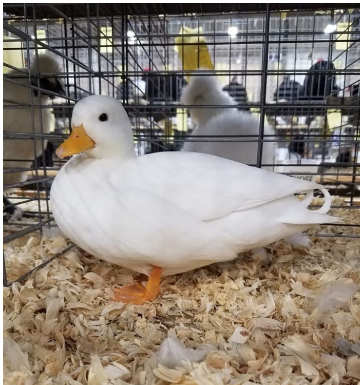
Junior Champion Waterfowl (3 entries): White Call drake submitted by Cathrynn Hager, Stamping Ground, KY . Reserve: East Indie hen submitted by L Beasley.