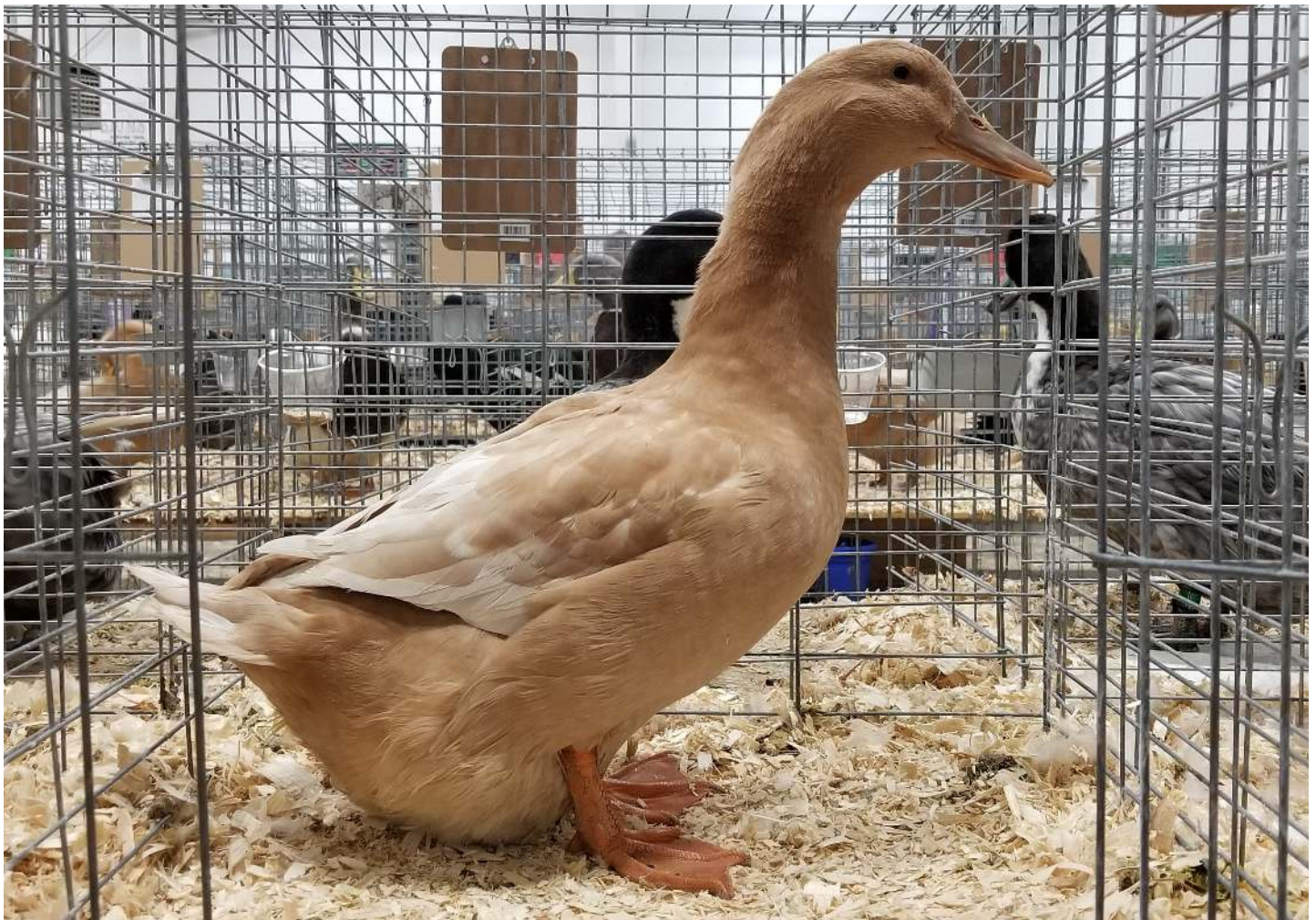
Buff female containing double copy of blue dilution

Buff ducks are unique to a specific structure that is often misunderstood. Occasionally, it would appear that some breeders are attempting to make buff Pekins with massive heads and lower bill placement. They are to have a structure formulated for meat with great length in the neck and body. Both the body and breast are to be deep and broad. The head is to be oval with a medium length bill, nearly straight in line with the top of the skull. Most buff ducks shown in the United States and Canada appear to be doing well in terms