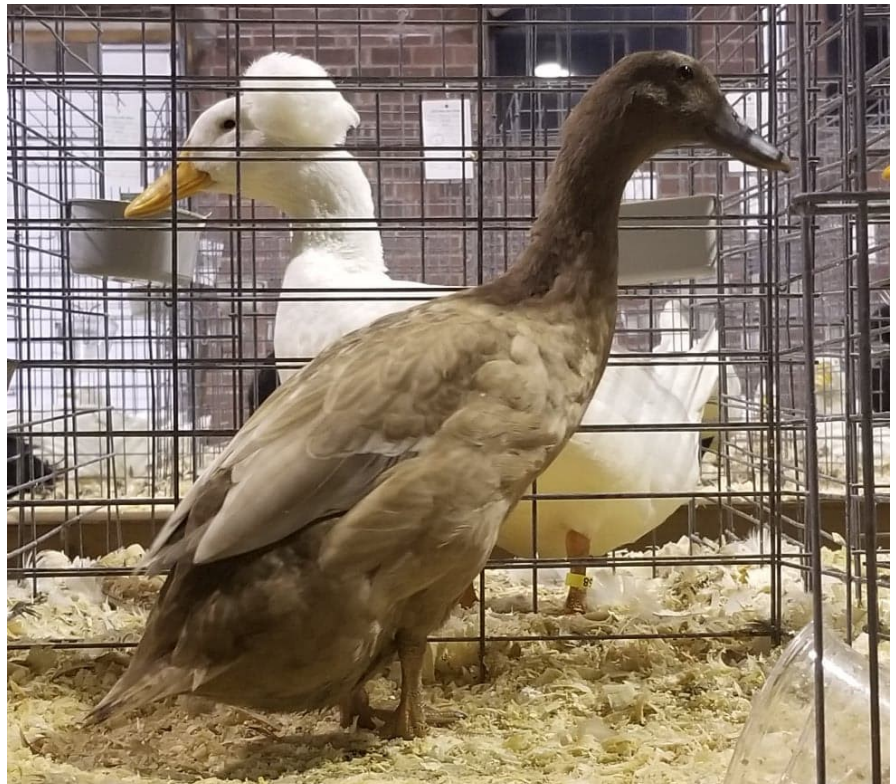
Khaki Campbell Female expressing the evenness in both khaki color and penciling

cellent buff drakes from the past. These drakes had nearly solid buff bodies, brown to buff heads, with minimal to no blue. Somewhere along the selection process the brown heads must have been disregarded. When breeding a brown headed drake (single blue) to a single blue (cinnamon) female, only a portion of the birds are going to be quality birds. 50% of the offspring will theoretically have a single blue dilution and be like their parents. 25% of the offspring will obtain two copies of blue dilution, which results in the bluish-grey head of drakes and a paler “buff” tone of the females. This variation is occasionally referred to as “blonde” and is the most commonly ob-