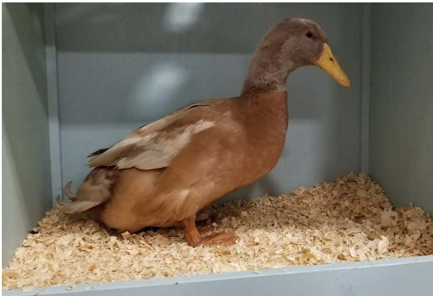
Buff drake containing double copy of blue dilution.

of broad and deep bodies, but greatly lack in length of the body and neck. The bill placement, in reference to the skull, should be more similar to a runner. As stat-