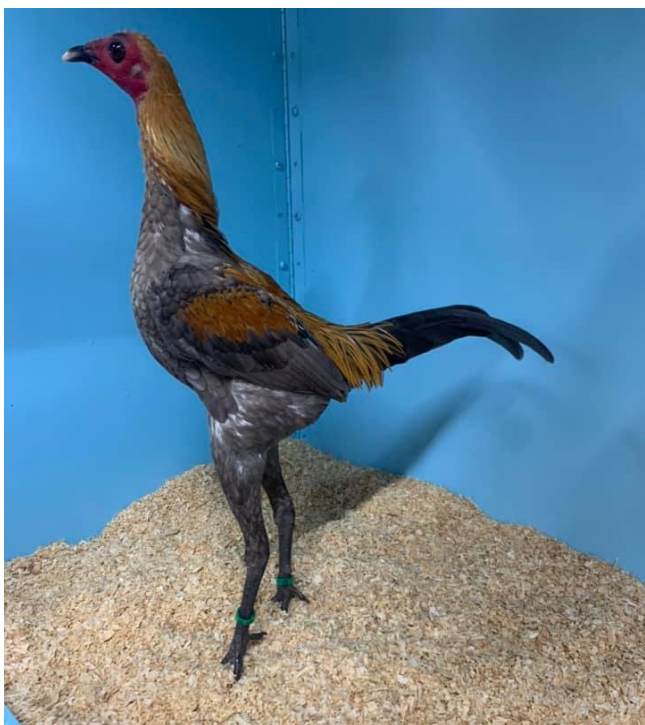
Open Champion MODERN (2 entries): Lemon Blue cockerel submitted by Samantha Wulff, Connersville, IN. Reserve: Birchen Pullet submitted by Jeff DuGuay.