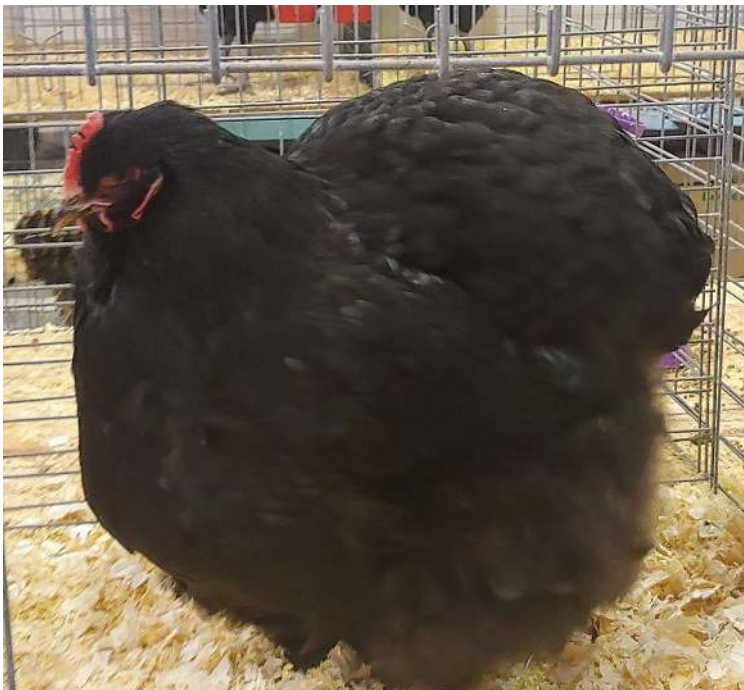
Champion Asiatic (11 entries): Black Cochin Hen submitted by M&M Exhibition Poultry, Harrod & Holland, Ohio. Reserve: Black Cochin Hen submitted by Jake Henderson.