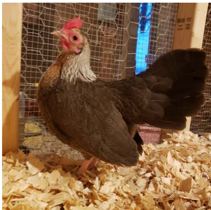
Junior Champion OEG : Silver Duckwing hen submitted by Landon Killmon, Upland, IN. Reserve: BB Red hen submitted by Bentley Reed.