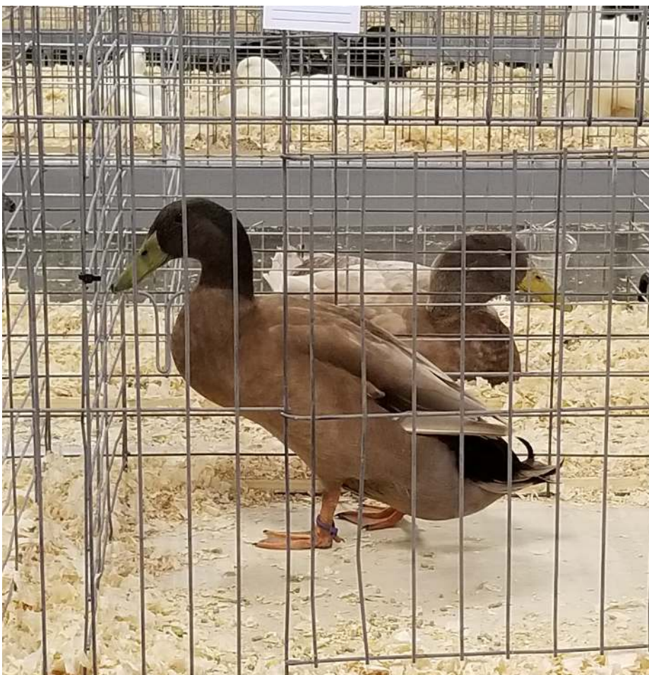
Above: Khaki Campbell Drake. Below: Buff drake containing single copy of blue dilution.